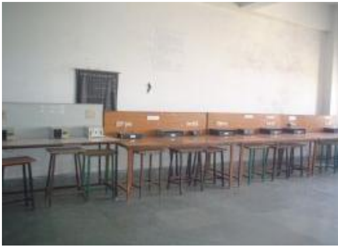
Digital Electronic Lab