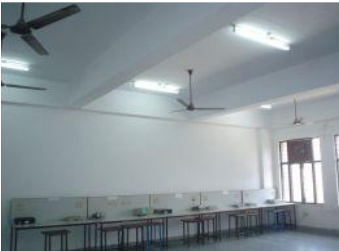
PCB & Electronic Workshop lab