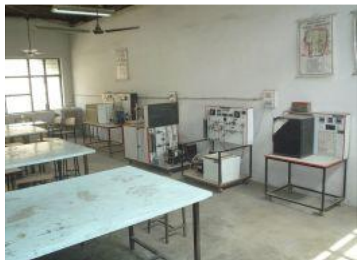
Refrigeration & Air Conditioning Lab