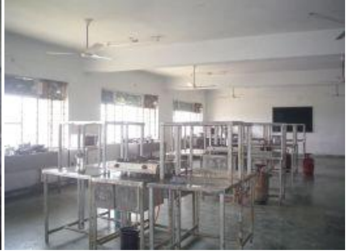
F& B Production lab