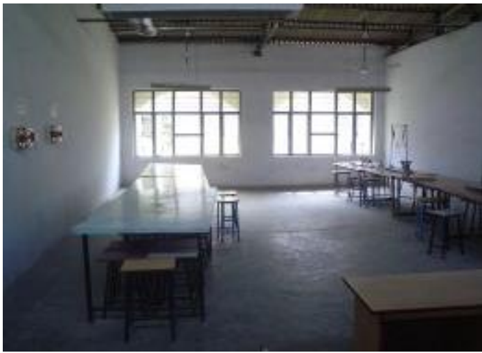
Engineering Mechanics Lab