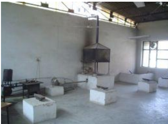
Black Smithy Shop