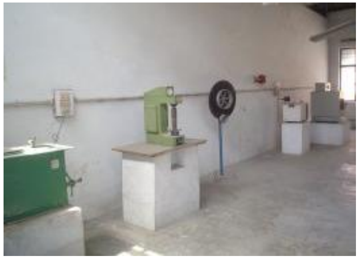
Material Science & Testing Lab