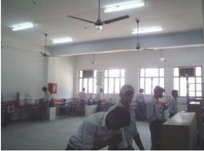
DC Machine Lab