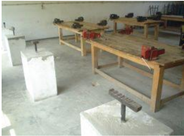
Sheet Metal Shop