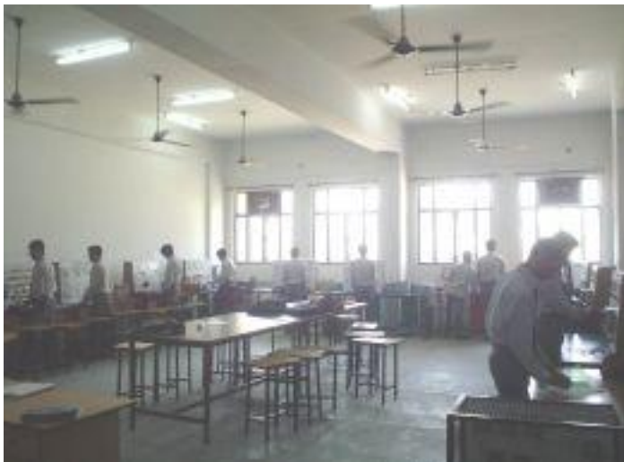
Electronic Engineering Lab