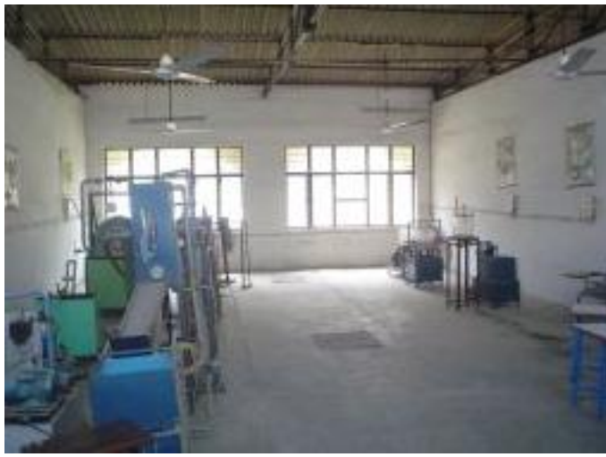
Fluid Machinery Lab