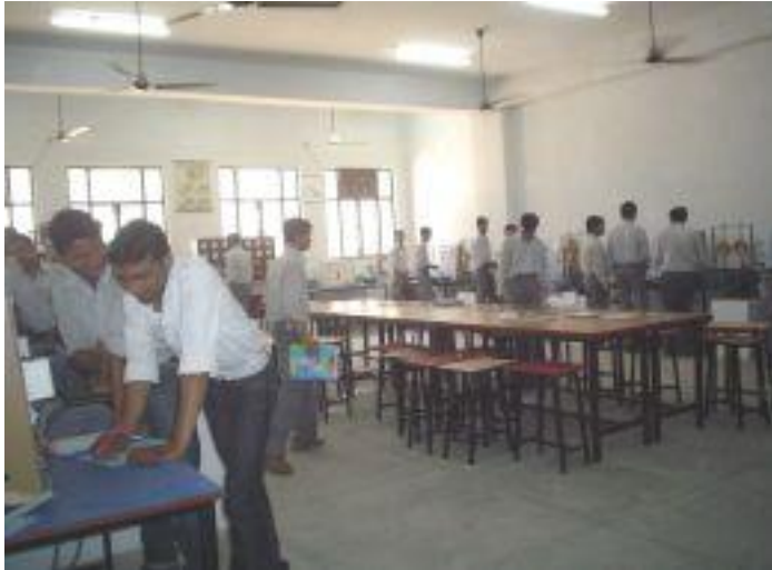
AC Machine Lab