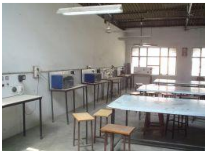
Heat & Mass Transfer