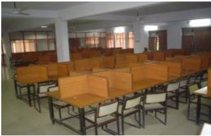
Reading Room (Library)