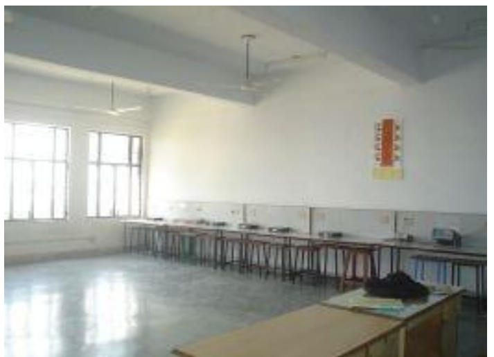
Electronic Circuit lab