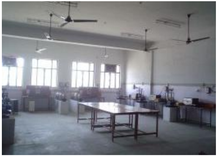
Electronic Derive Lab