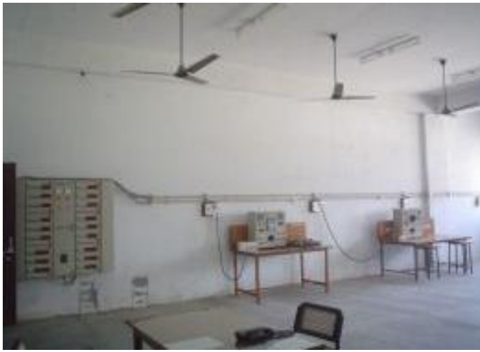
Power System Lab