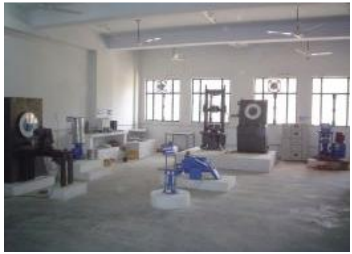
Building Material Lab